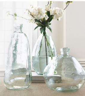
Rope & wood buffet serveware, 40.00-50.00; 'Erica' Dinign Chair, 799.00; French Bead Chandelier, 1475.00; 'Morph' Vases, 40.00-45.00