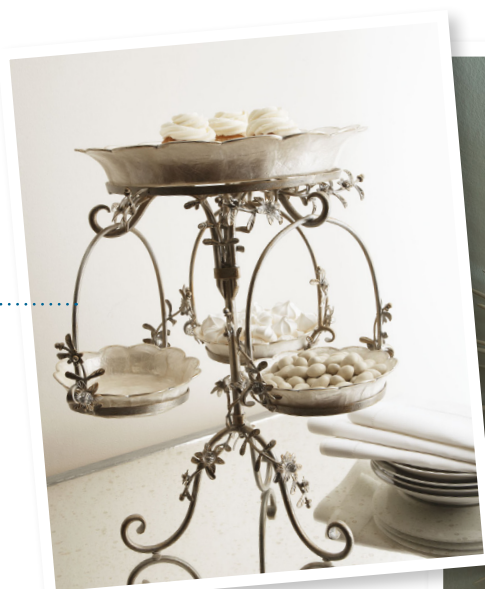
A FRILLY EPERGNE CONTRASTS WROUGHT IRON WITH PEARLESCENT CAPIZ SHELL

THE NATURAL BEAUTY OF PROVENCE, PORTUGAL, AND MOROCCO INSPIRES HER CLEVER INTERPRETATIONS OF ORGANIC SHAPES & TEXTURES. THESE ARE EXCLUSIVELY OURS.