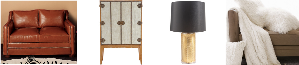
Old Hickory Tannery small leather sleeper, 3,799.00; Carmella bookcase, 4,799.00; Golden Westwood lamp, 395.00; Adrienne Landau pillows & throw, 395.00-1,295.00