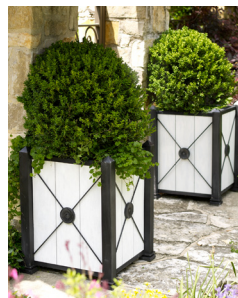
Large X-design Lantern, 185.00 each; Trina Turk Pillows, 295.00 each; 'Parisian' Planters, 474.90-594.90