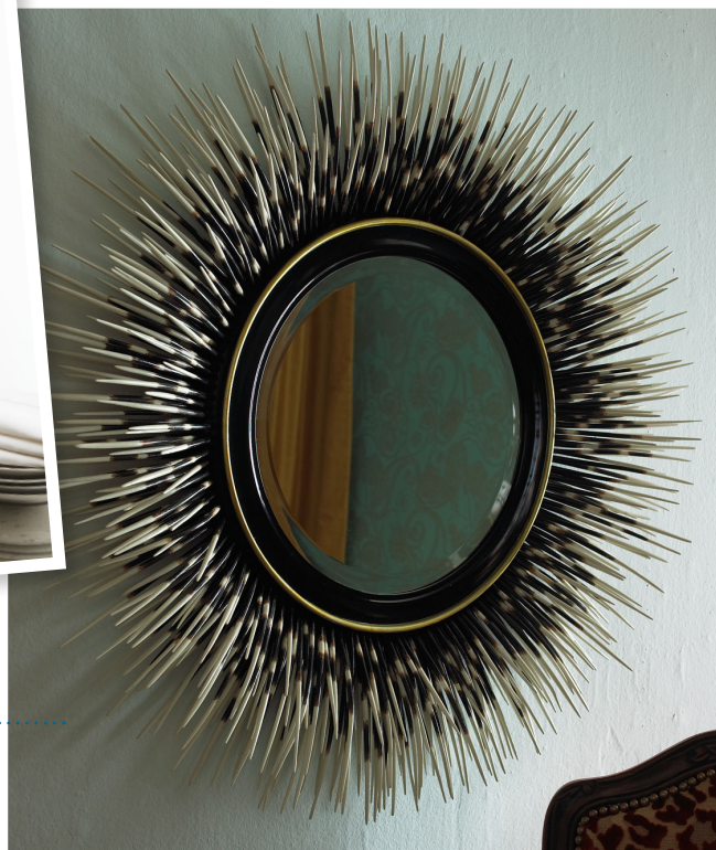
HANDPAINTED WOOD MIMICS PORCUPINE QUILLS IN THIS PRICKLY MIRROR

Imagine a vacation so fabulous, people actually want to see your pictures.