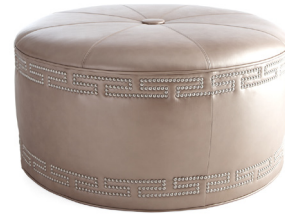
'Slated' Chair, 1718.90; Mosaic Lamp, 479.90; 'Gold Kiana' Mirror, 395.00; Champagne Ottoman, 1999.00