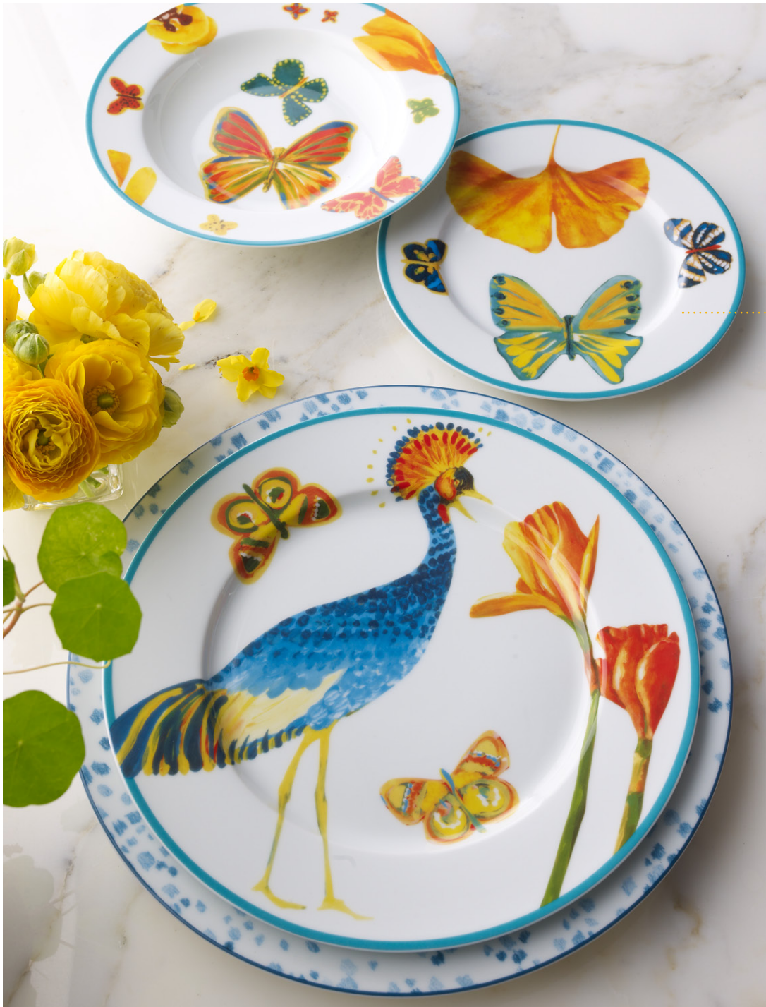
BYZANTINE PORCELAIN DINNERWARE