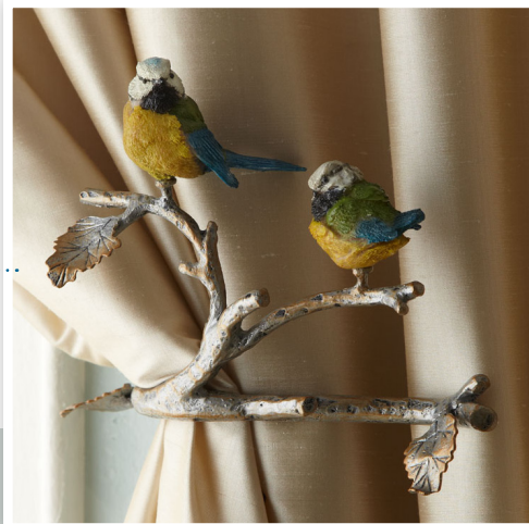
COLORFUL BIRDS ON AN IRON BRANCH CREATE A CHARMING CURTAIN HOLDBACK