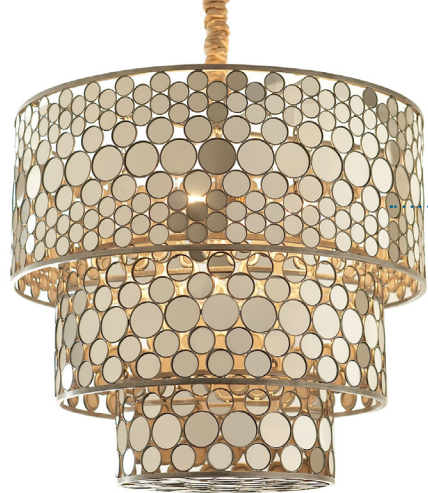
SNAKESKIN PATTERNS INSPIRED THIS TIERED CHANDELIER WITH MIRRORED ACRYLIC DISCS