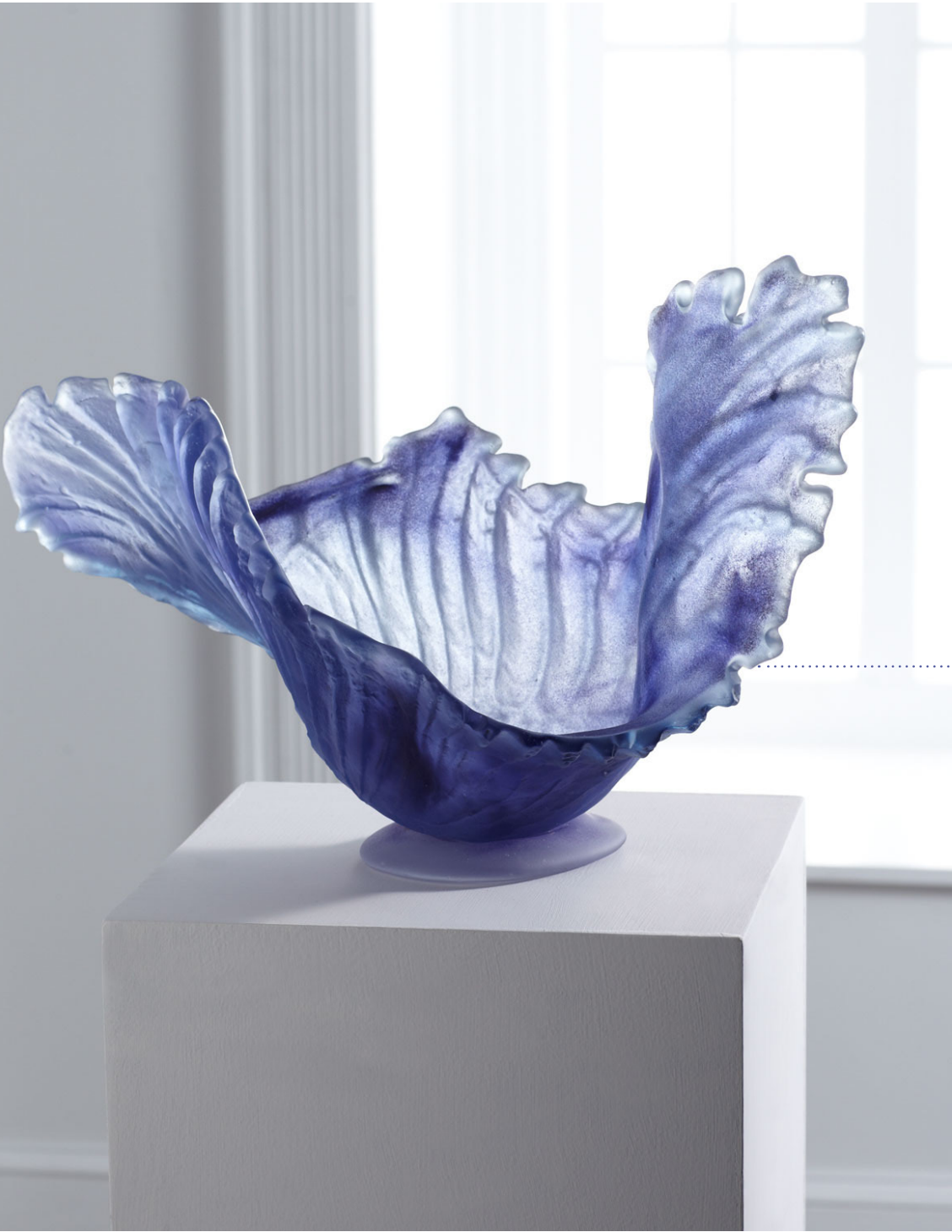
"BLUE VIOLET" GLASS BOWL