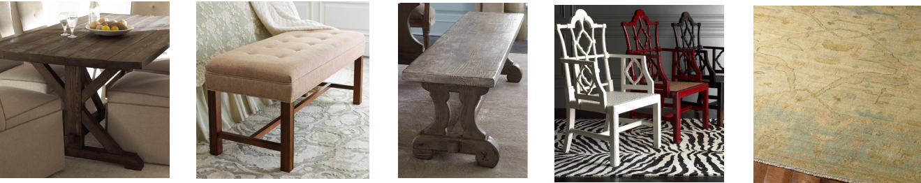
Carlyle dining table, 1,749.00; Shea bench, 549.00; Chariot bench, 1,649.00; Italia chairs, 999.00/two; 8x10 Ocean Light oushak rug, 3,699.00